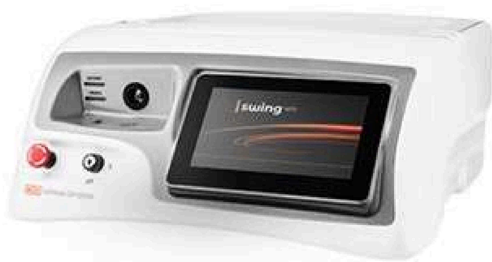
SWING 1470 Diode Laser