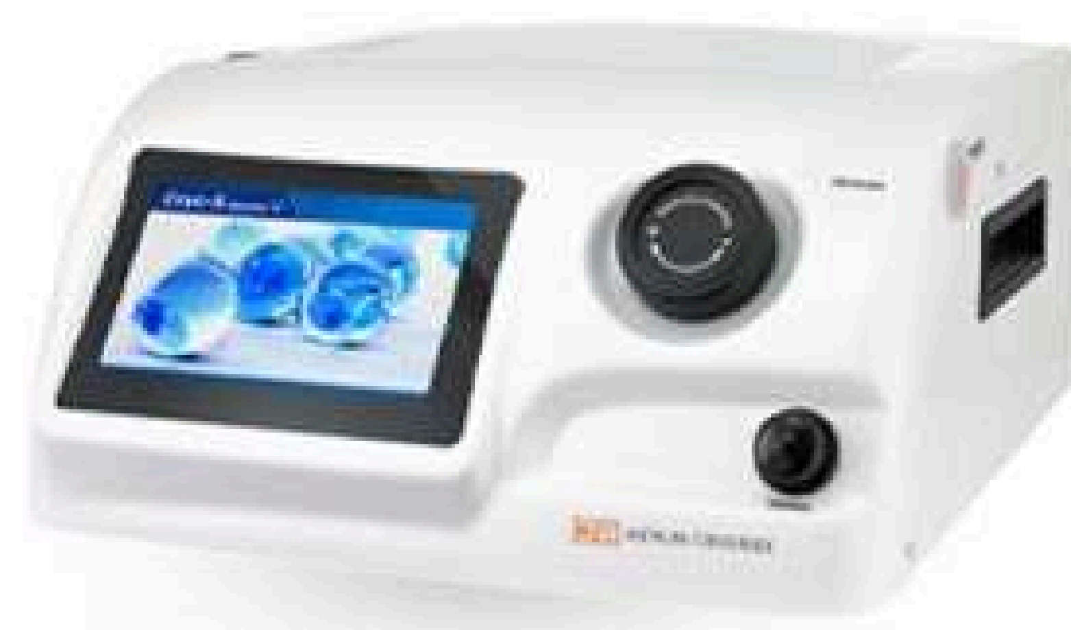
CRYO-S ELECTRIC II Advanced Gynaecology & Ophthalmic Care