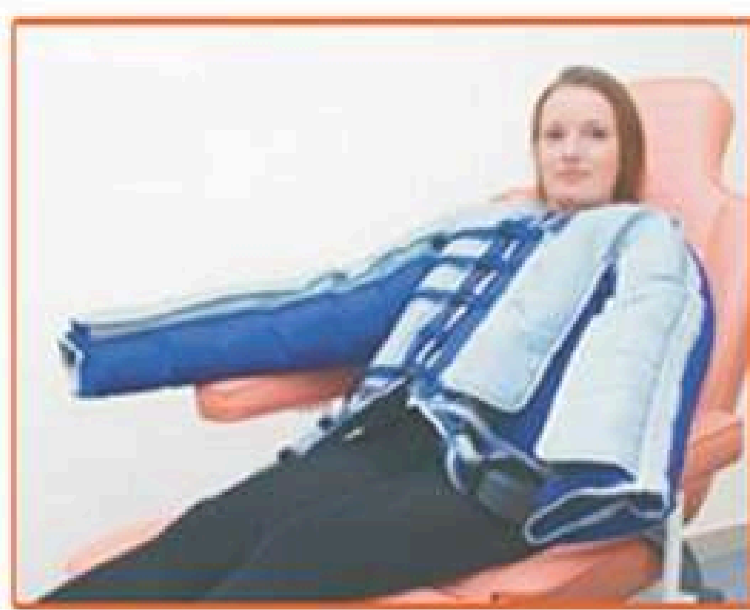
24 chambers jacket