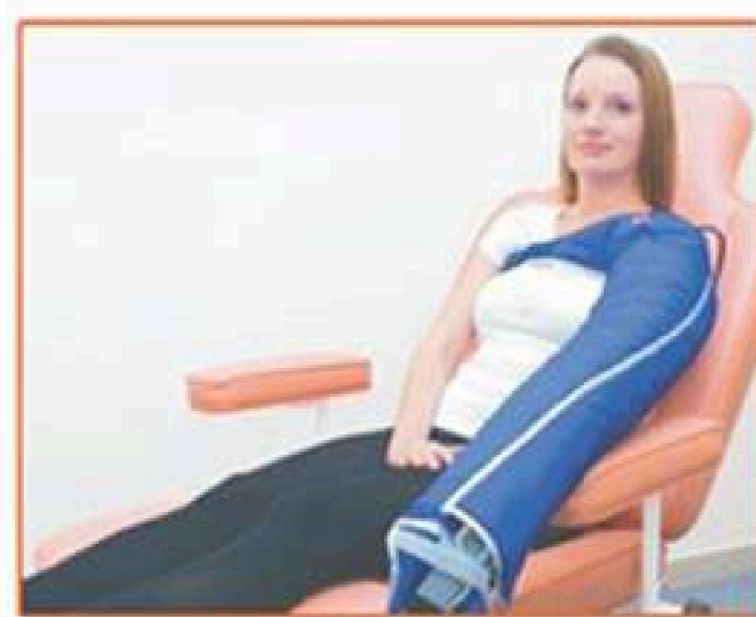
12 chambers cuff (L,R)