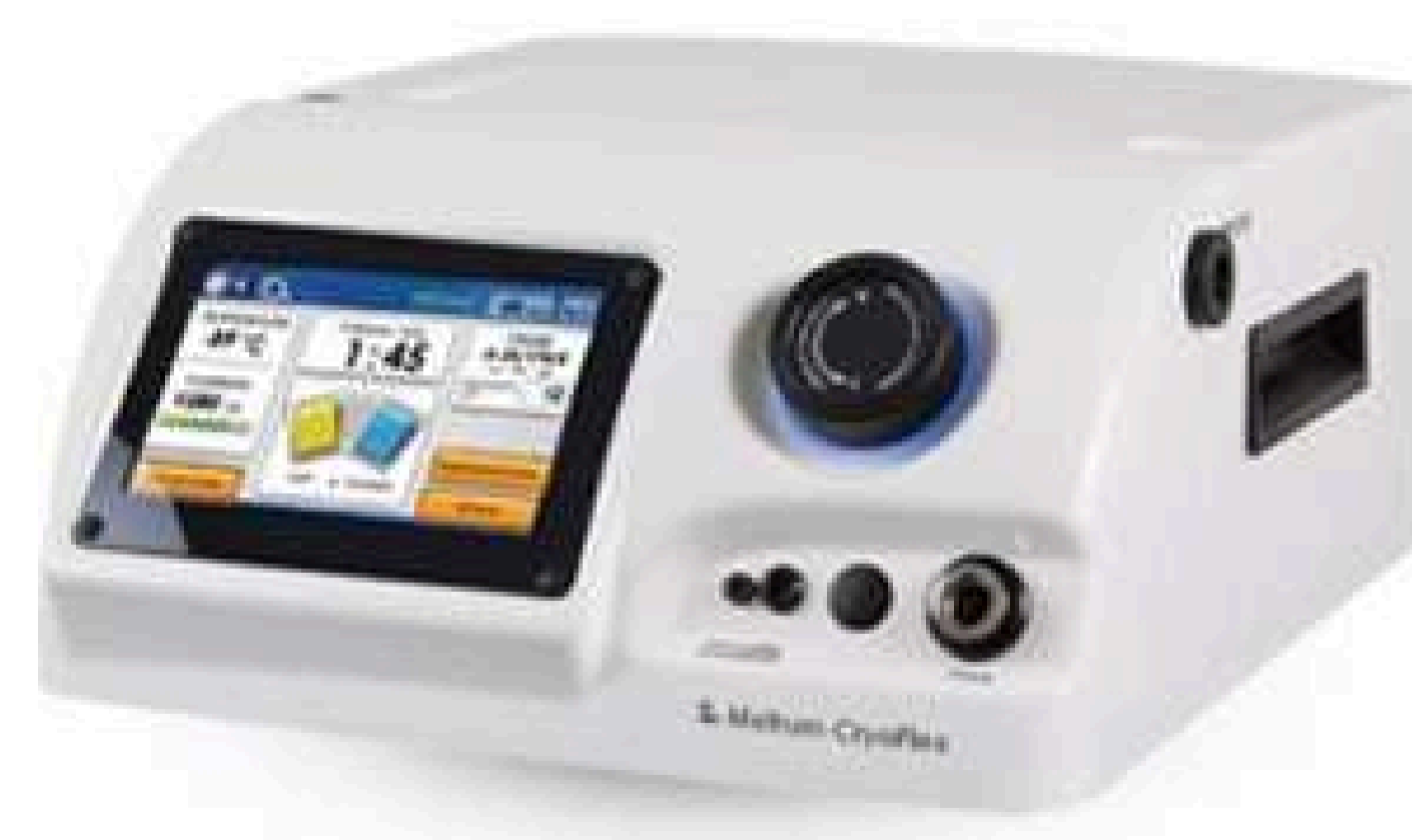
CRYO-S PAIN Relief System Scar-Free