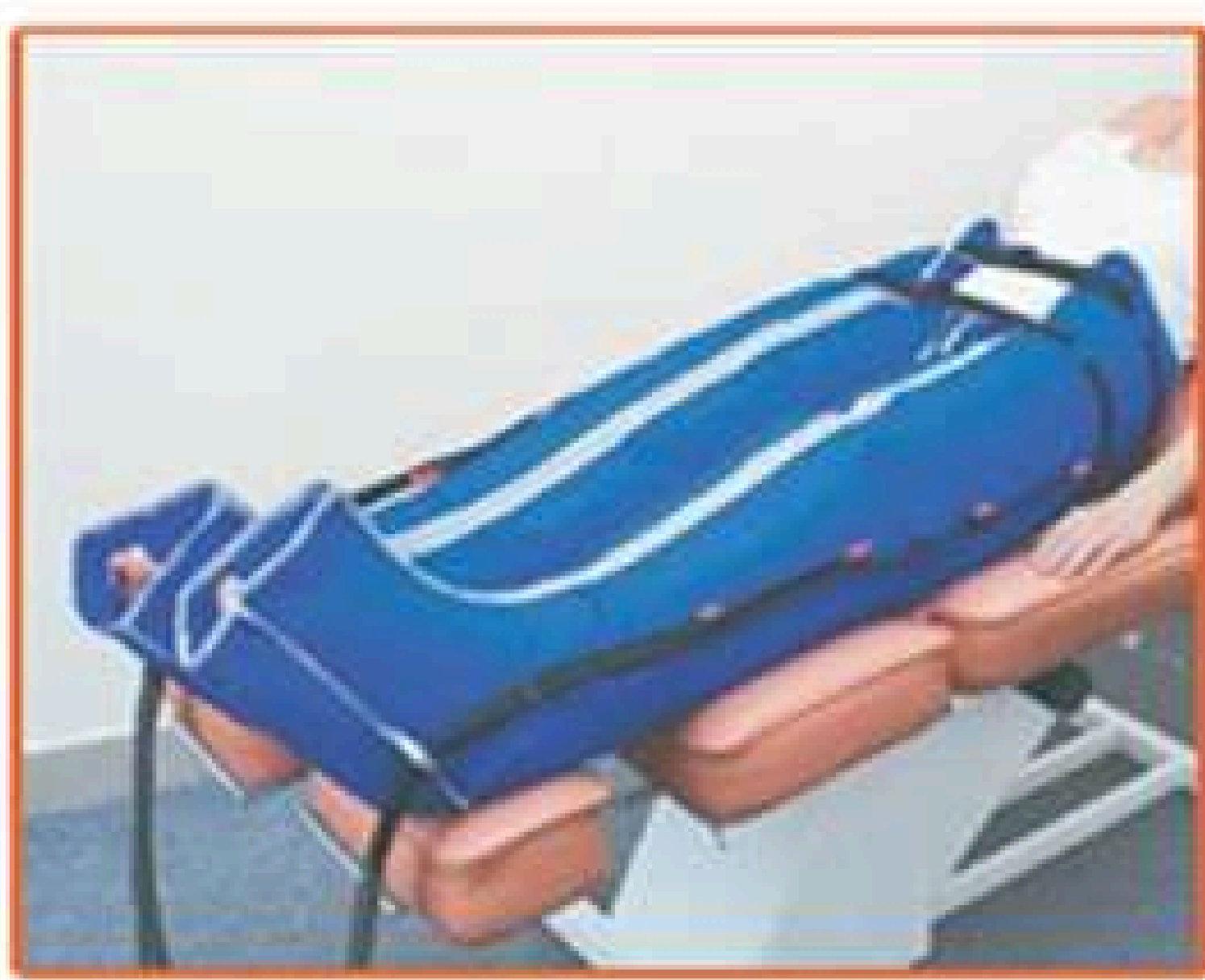
24 chambers pants